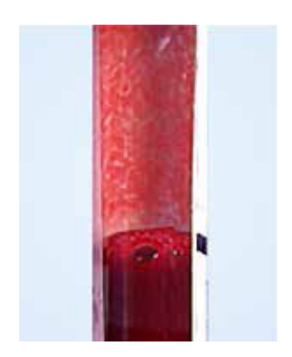
Figure 2. Entire inner surface of tube must be coated with blood.