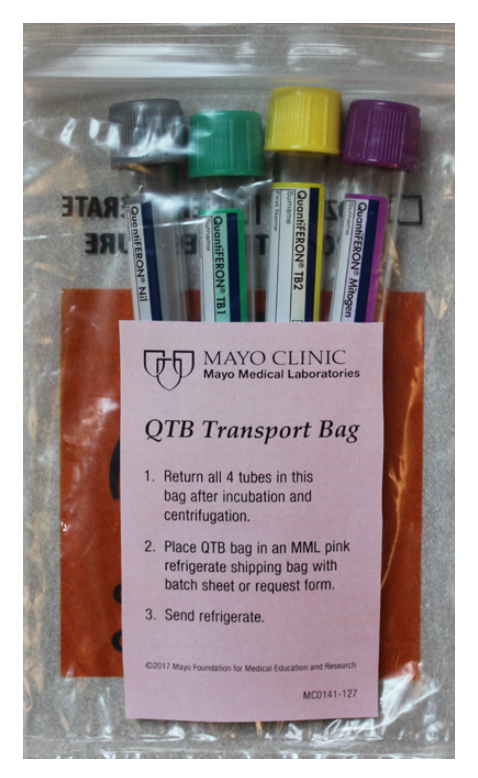
Figure 3. Shipping (Ship QTB kit refrigerate: 2°-8° C)